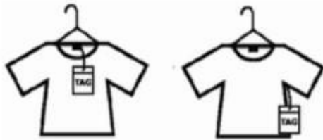
Where to hang the tag on a shirt: 2 options