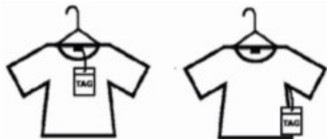
Where to hang the tag on a shirt: 2 options

(Note: Choose ONE tag location. Only one tag per garment.)