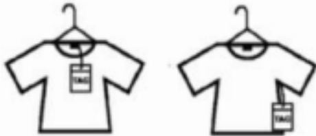
Where to hang the tag on a shirt: 2 options

(Note: Choose ONE tag location. Only one tag per garment.)